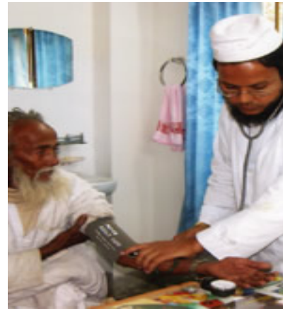
Angel Medical Clinic