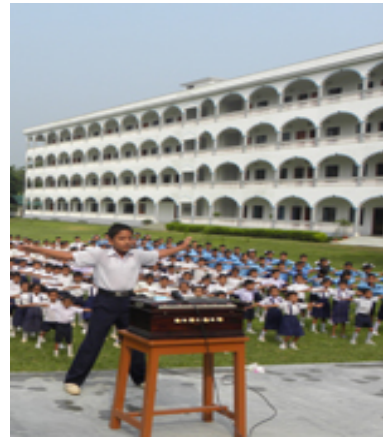
Yuriko Angel School